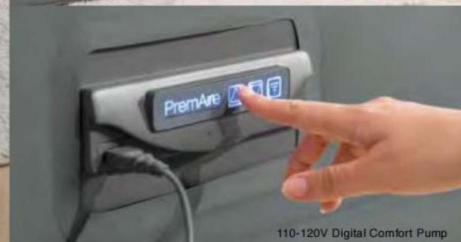
110-120V Digital Comfort Pump